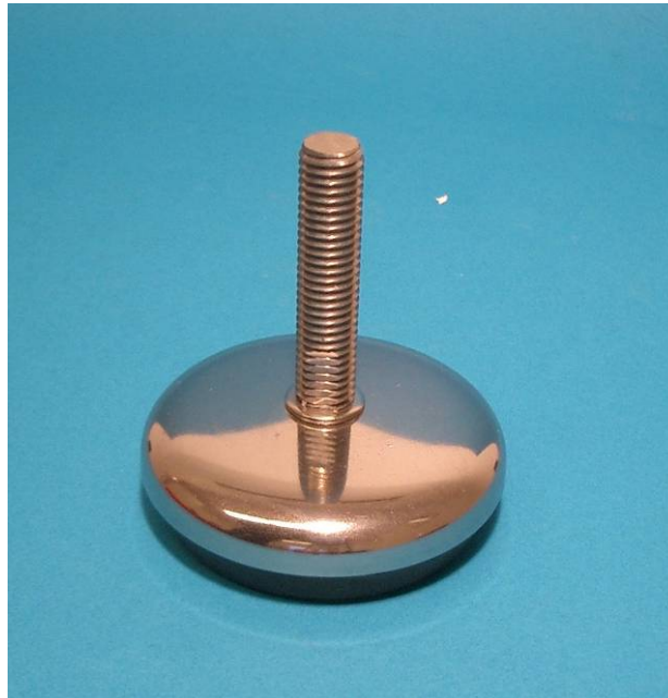
Model DT 10