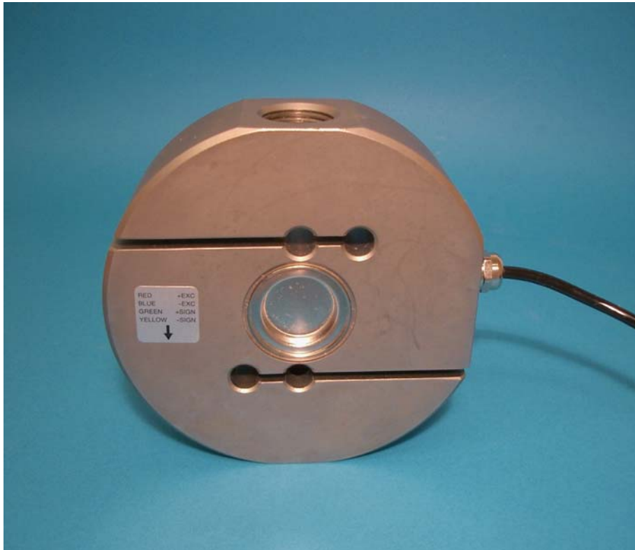
MODEL DT 8220