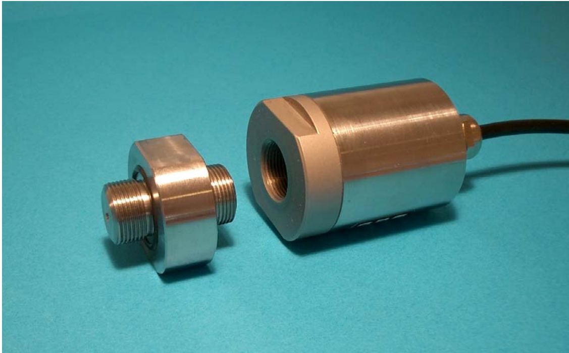
MODEL DT 1001