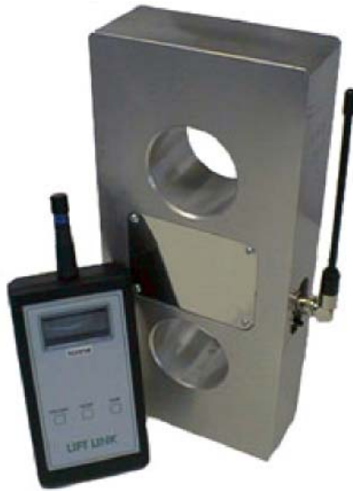
MODEL DT 8292

LOAD LINK MODEL DT 8292 STANDARD CAPACITIES: From 1 Tons to 500 Tons