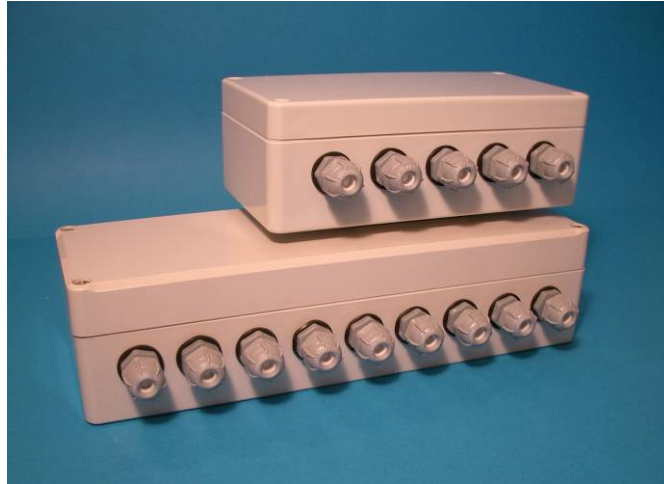
MODEL DT 04/ DT 08

DT 08 JUNG-BOX UP TO 8 LOAD CELLS IN HERMETIC PLASTIC