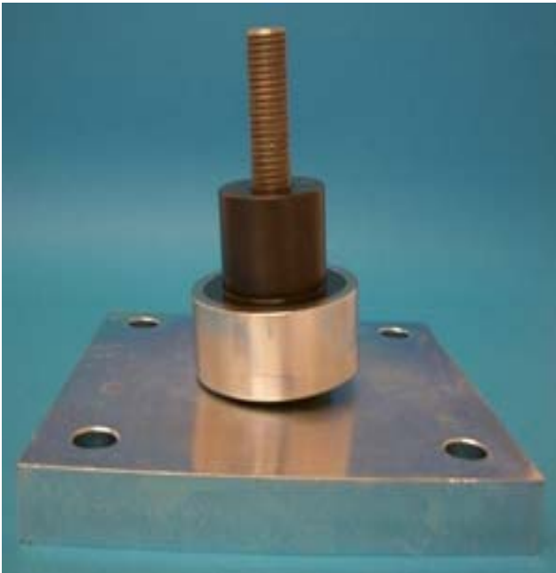
MODEL DT 1M20